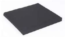
Seat cushion black cover