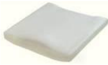
Jay Basic (picture shown without upholstery)