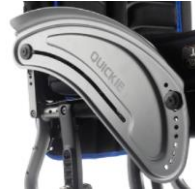
Aluminium sideguard with fender