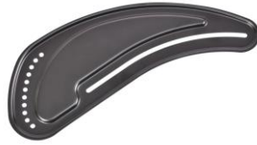
Aluminium sideguard w/o fender