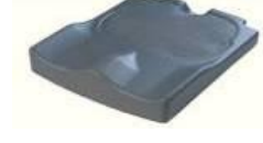
Jay Easy Visco (picture shown without upholstery)