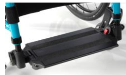
Aluminium Footplate platform