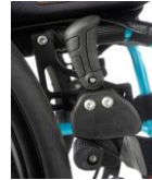
Knee lever wheel lock