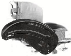
Carbon Seitenteil mit Kleiderschutz