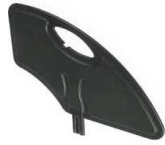
Plastic regular, detachable