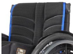
EXO PRO backrest sling (EXO Evo version)