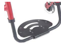
Aluminium board (XENON performance)