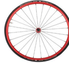
Lightweight wheel, anodized red