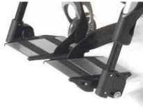
Aluminium Footplate divided