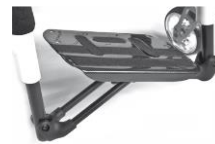
Autofolding carbon board