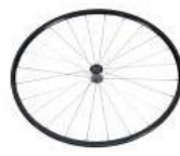
Light weight wheel