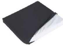
Seat cushion with water resistant / breathable cover