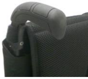
Integral push handles long