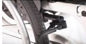
Compact wheel lock