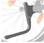
Tip assist left