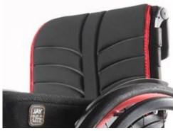
EXO backrest sling (EXO Evo version)