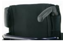
Fold down push handles