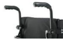
Height adjustable push handles for JAY