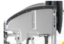
Aluminium sideguard with fender