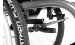
One arm wheel lock right