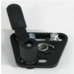
Standard Wheel lock