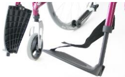
Angle adjustable footplates (composite)