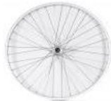
Universal Cross spoked