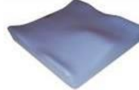
Jay Soft Combi P (picture shown without upholstery)