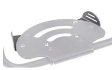
Foot positioning plate