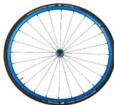
Lightweight wheel, anodized blue