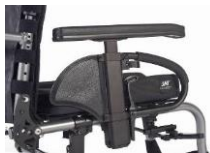
Single Post Height Adj. - Adult