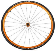
Lightweight wheel, anodized orange