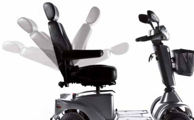
→ Quick backrest angle adjustment