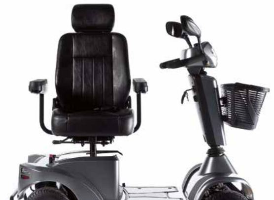
→ Seat rotation enables comfortable transfers