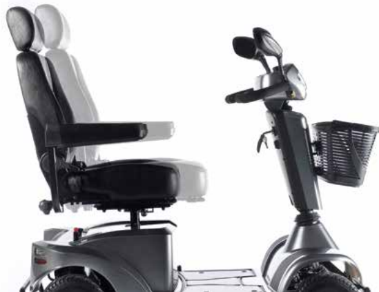
→ Infinite seat depth adjustable

The S-SERIES advanced seating solution, takes comfort to the highest level, from the seat height, depth and recline adjustments, to the flip up, width, angle and depth adjustable comfort armrests – every feature has been designed for comfort – for you.